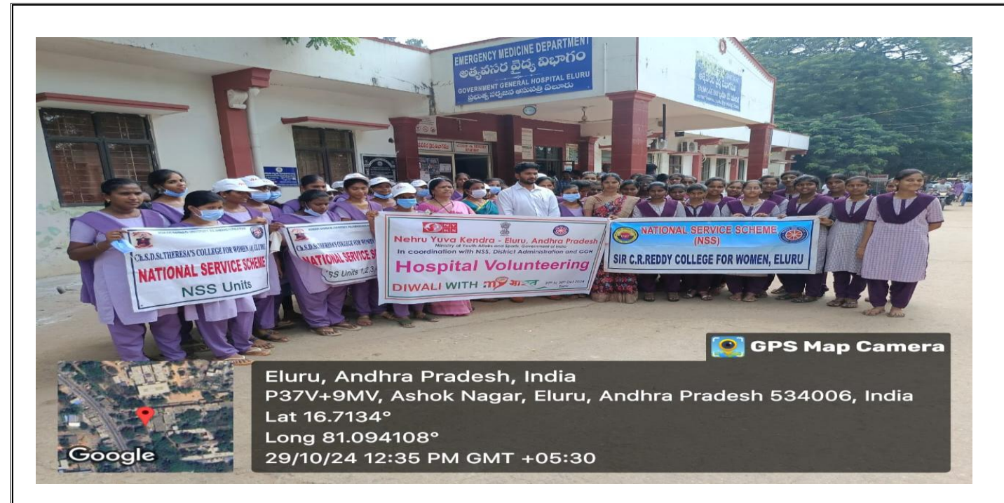
NSS students participated in Diwali with my Bharat programme at Govt.Hospital,Eluru.