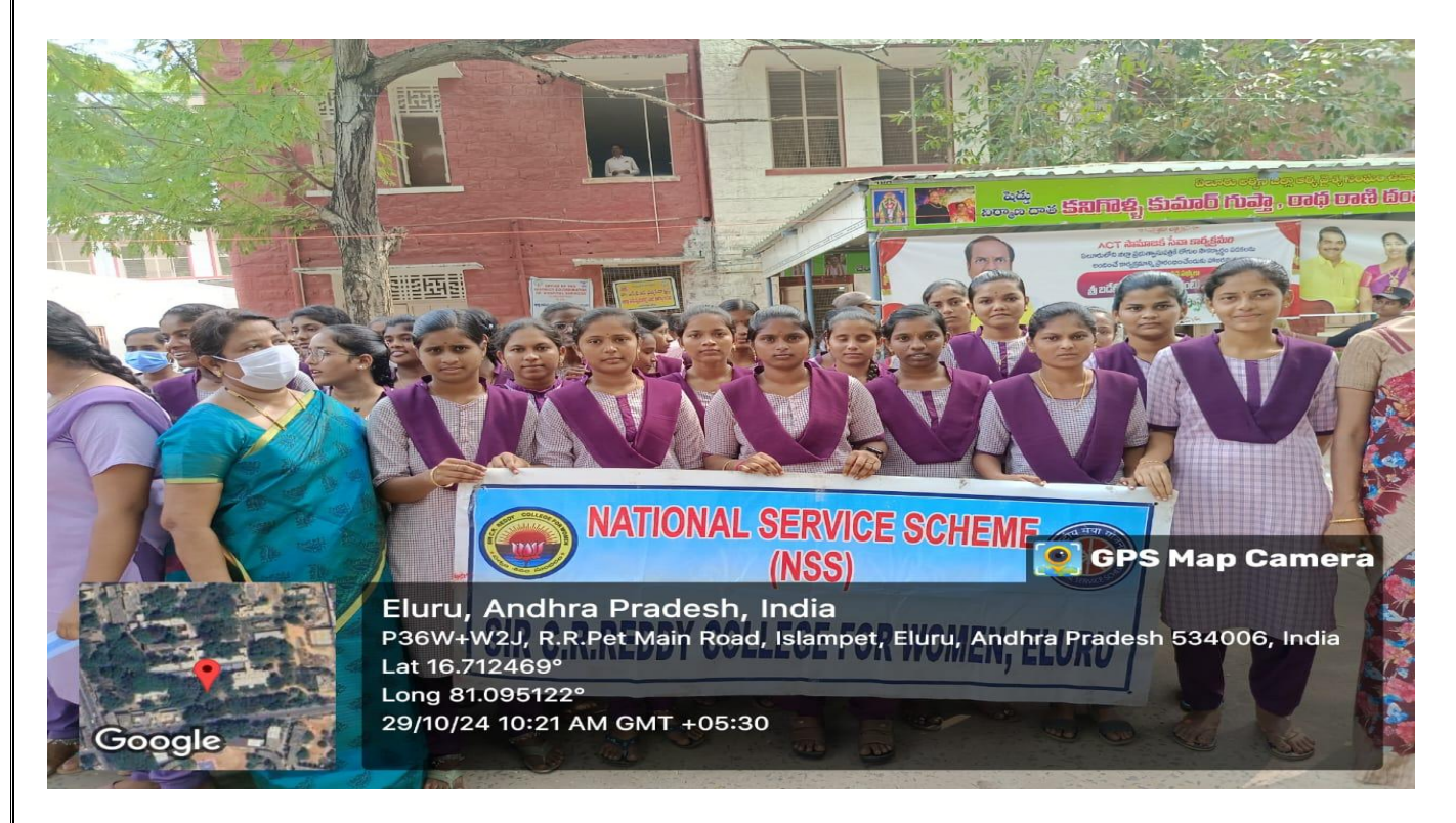
NSS students participated in Diwali with my Bharat programme